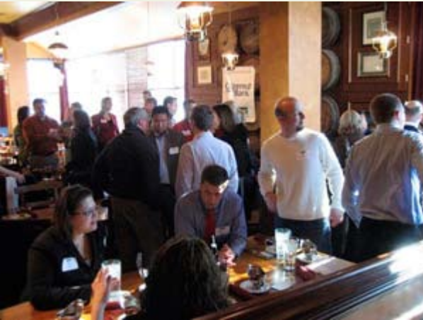
Our Tomorrow's Leaders group gathered in January with Twin West and Wayzata Chambers you professionals for lunch.