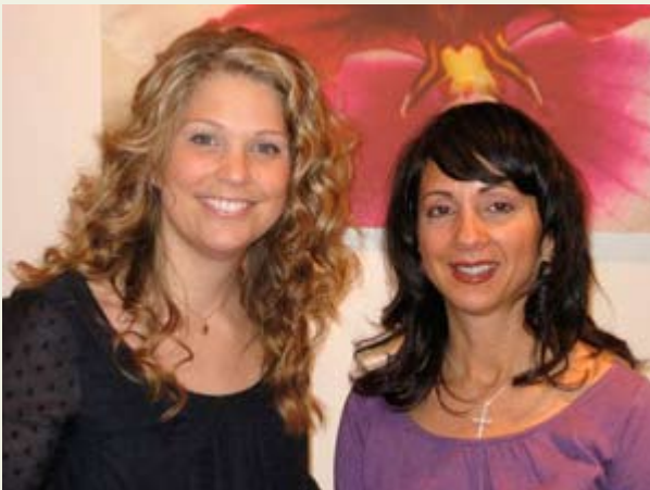
Thank you to our hosts at Juut Salon Spa at Southdale.