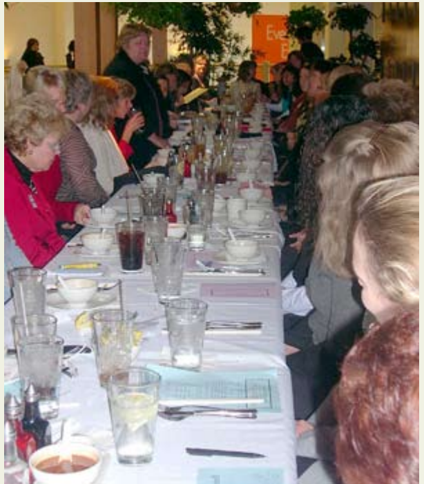
It was standing room only for January's WISE event at P.F. Changs China Bistro.